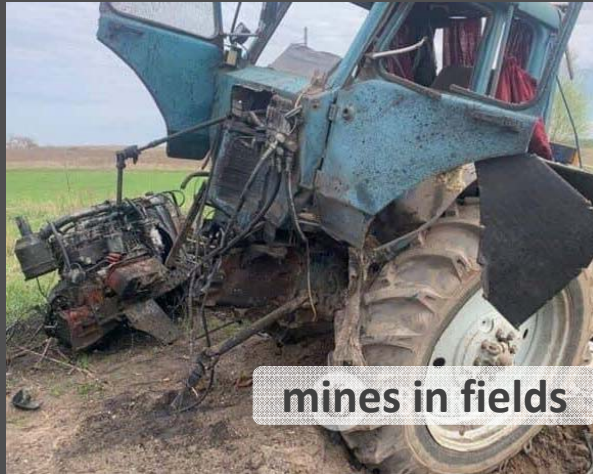
mines in fields