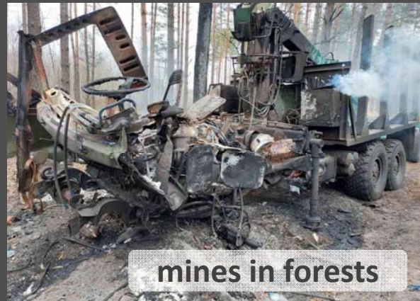
mines in forests